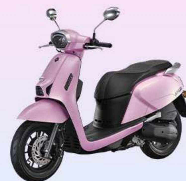
◆ CARNATION PINK