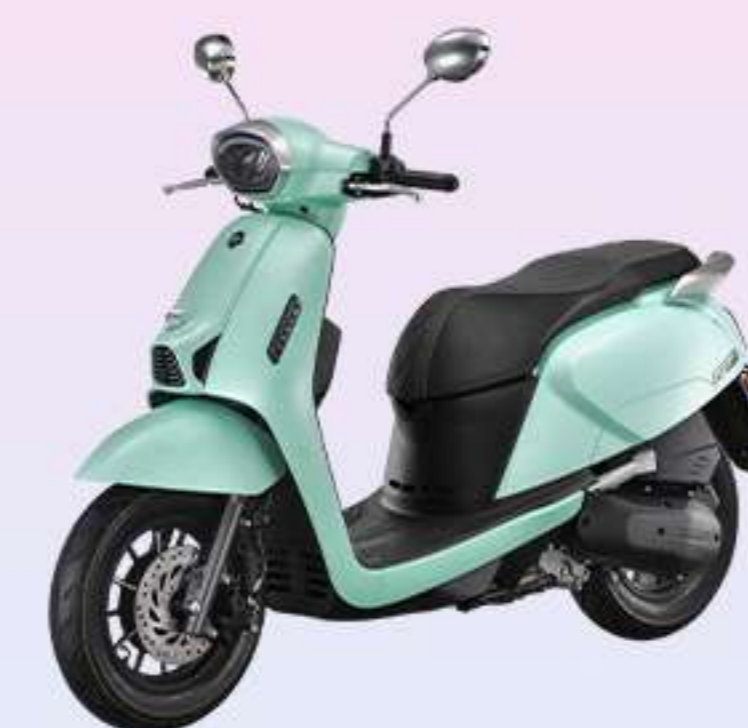
◆ MINT GREEN

*Subject to change without prior notice.