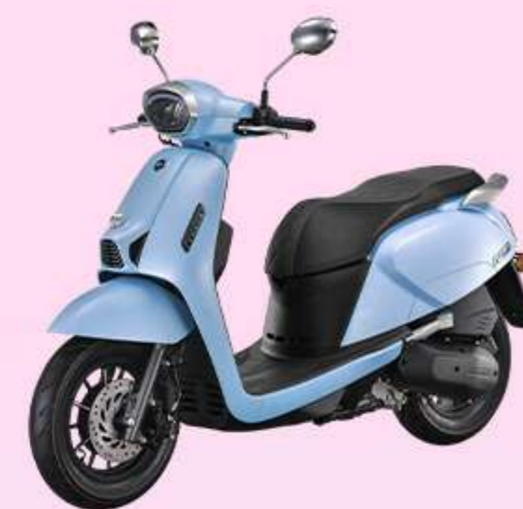
◆ SKY BLUE