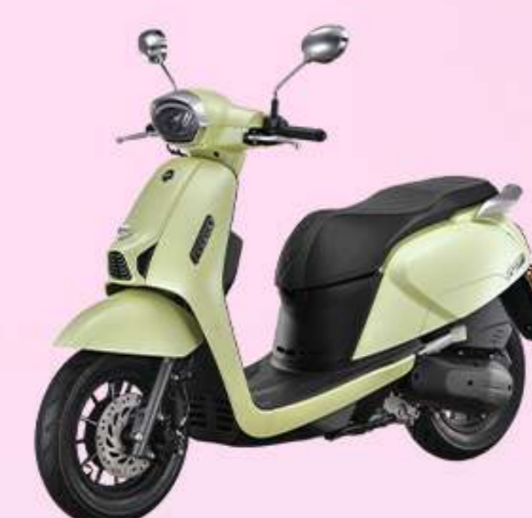
◆ LIME CREME